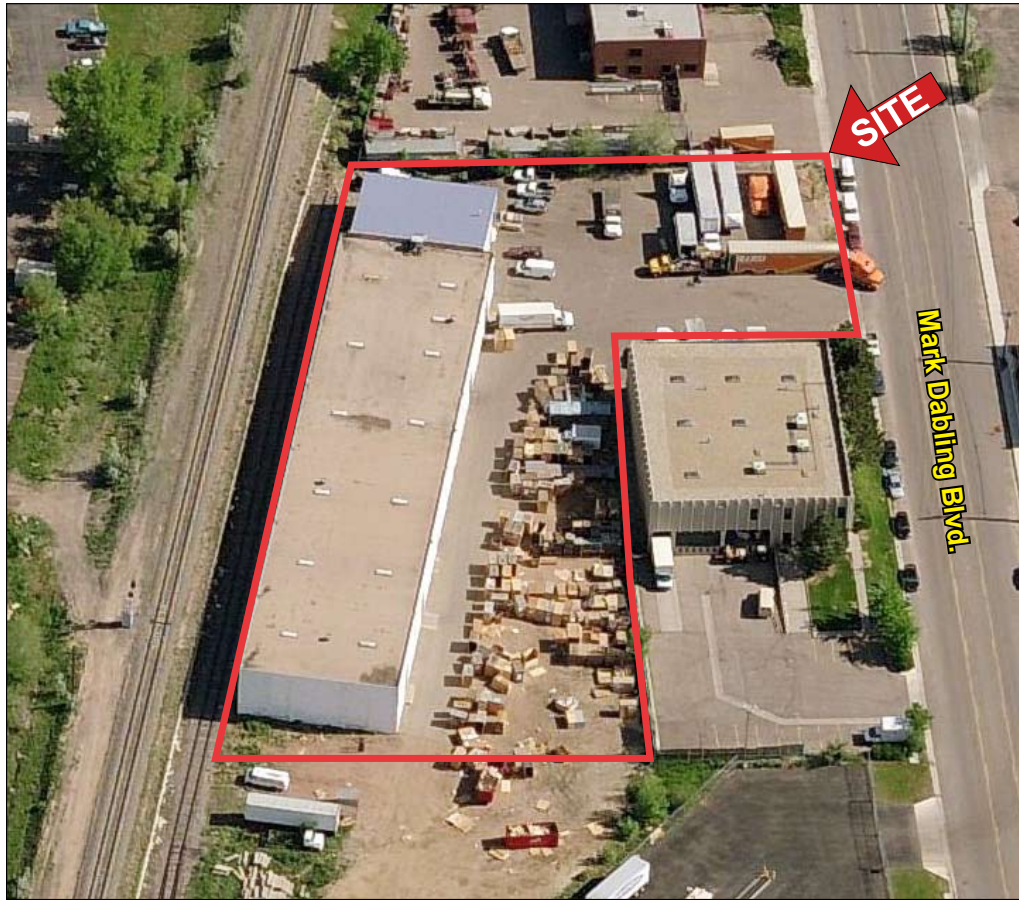
4440 Mark Dabling Blvd.